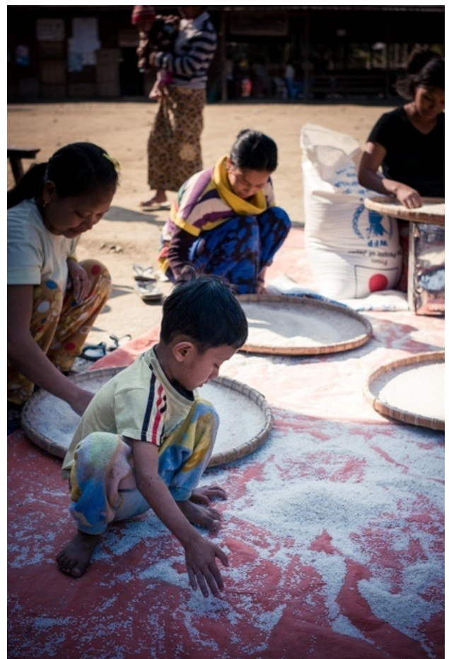
IDPs in Kachin, April 2012.

Preparedness measures and planning for natural disasters will continue, including support to the newly passed national Disaster Management Law and related legislation. The Humanitarian Country Team will continue to monitor and anticipate humanitarian needs across the country, working with the Government to respond in situations that require international assistance.